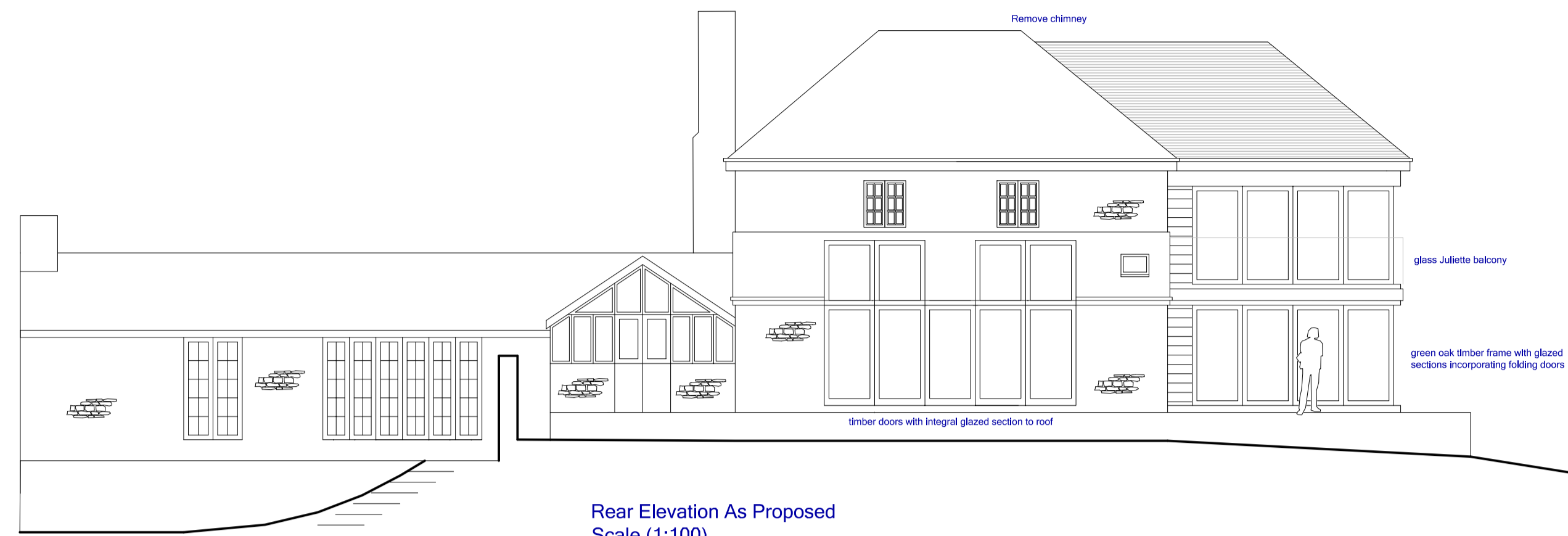
Rear Elevation As Proposed Scale (1:100)