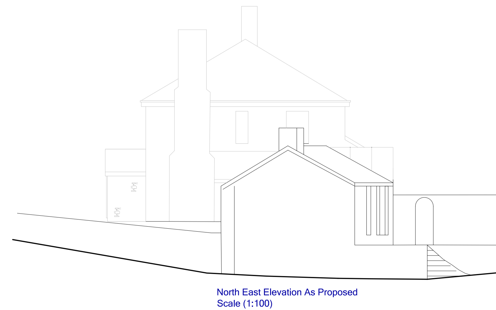
North East Elevation As Proposed Scale (1:100)