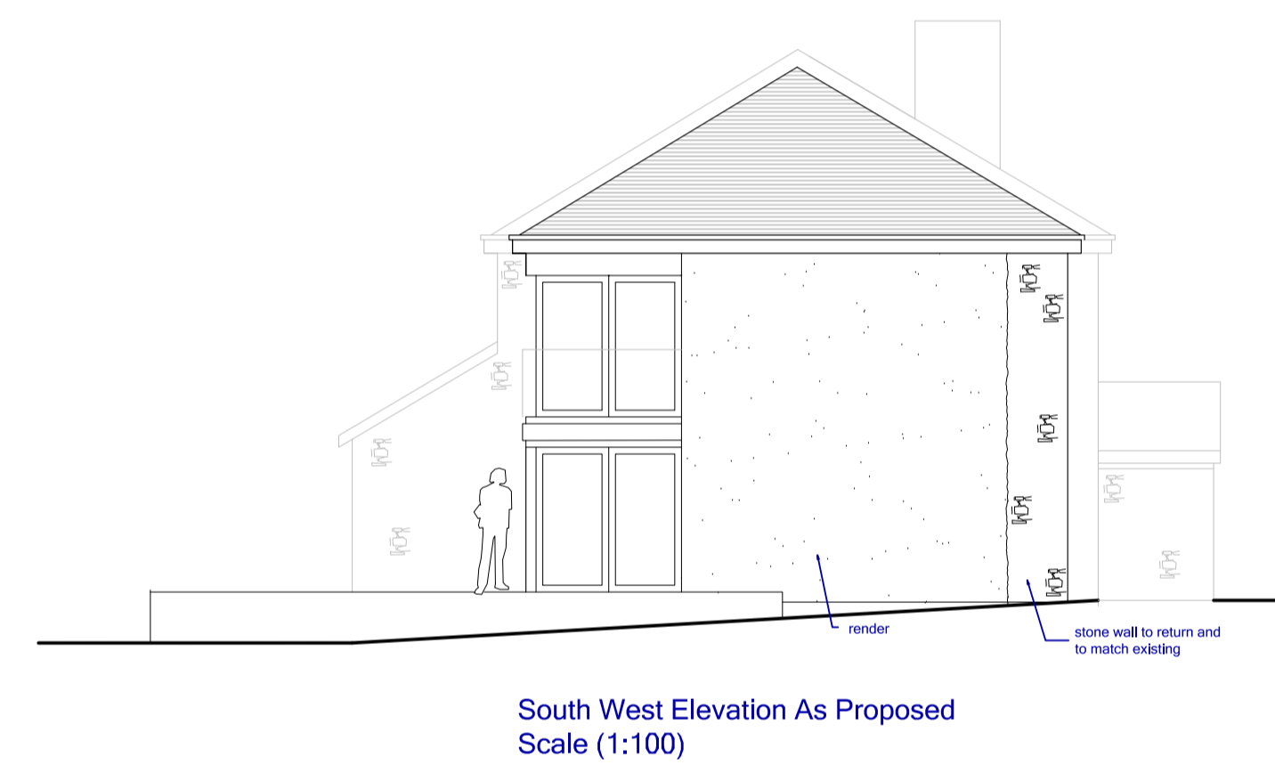
South West Elevation As Proposed Scale (1:100)